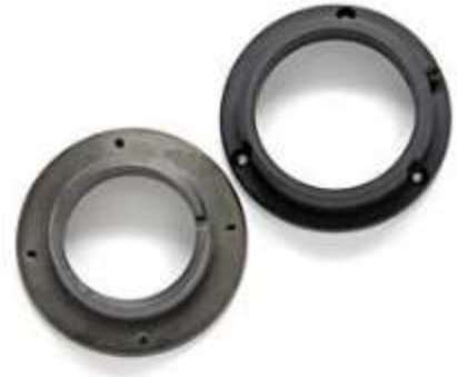
Fig. 1 #32 Nikon Type Microscope Mount Set